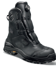
Brimir S3 SRC BRIMS30NR