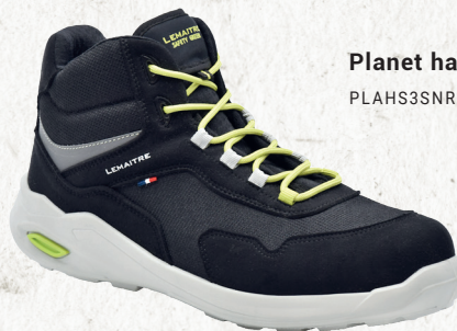
Planet haut noir S3S PLAHS3SNR