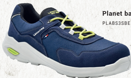
Planet bas bleu S3S PLABS3SBE